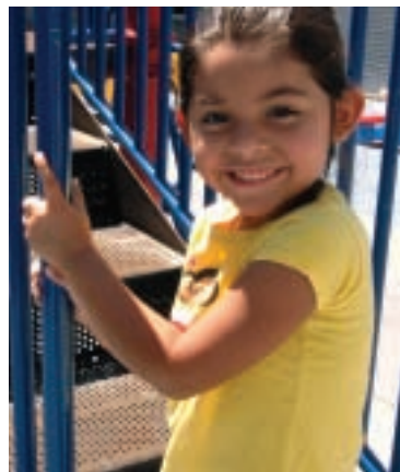
Girl in this photograph is a model and not a client of the Chicago Children's Advocacy Center.

Chicago House and Social Service Agency Chicago, IL Second payment of a two-year $44,000 grant for the Increase Income and Independence Initiative $22,000