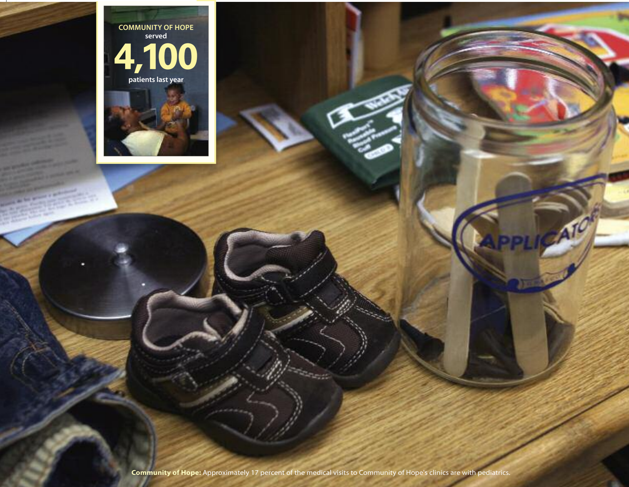
Community of Hope: Approximately 17 percent of the medical visits to Community of Hope's clinics are with pediatrics.