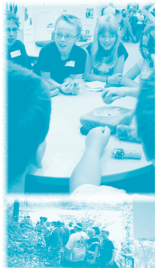
EDUCATION AT WILDWOOD

Board Supervision —All aspects of the CFTT are overseen by a community-based board of exceptional business persons, professionals, philanthropists and civic leaders who commit time, experience and support to help the CFTT grow and thrive.