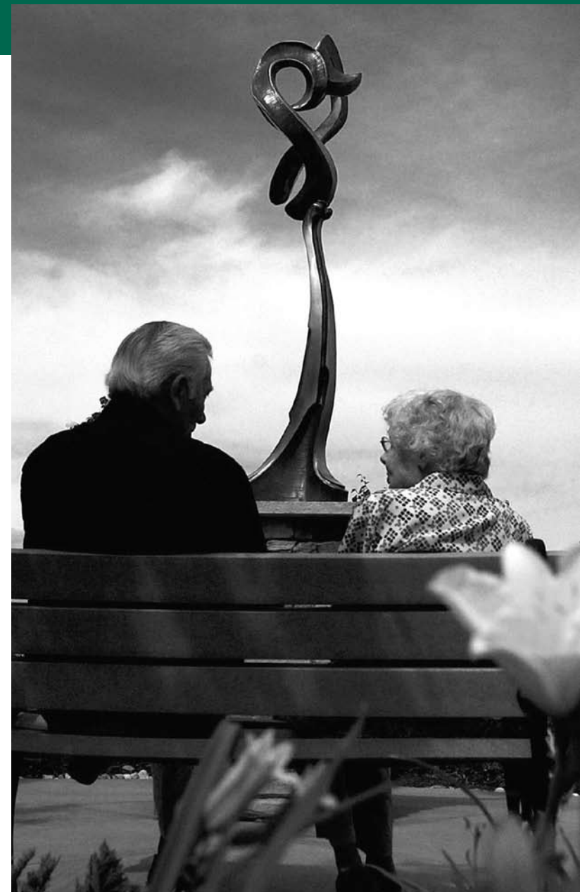
Two Hospice of Larimer County volunteers enjoy one of the nonprofit agency's memory gardens.