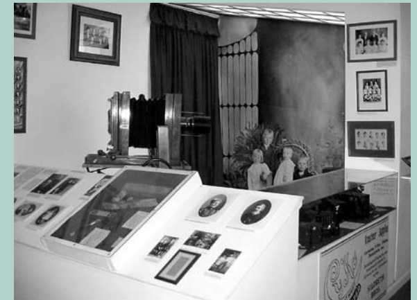
BERTHOUD HISTORICAL SOCIETY ENDOWMENT FUND: This exhibit at the Little Thompson Valley Pioneer Museum depicts the Hildreth Brothers Photographic Studio of Berthoud established in 1906 on Massachusetts Avenue.