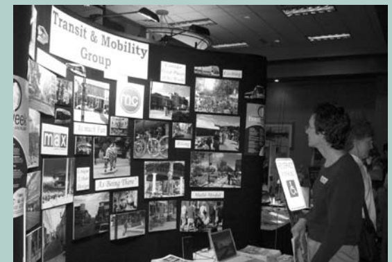
UNIVERCITY CONNECTIONS FUND: A UniverCity Connections participant reviews the task group displays at the May 2007 celebration event.

Mrs. Walsh's Xeriscape Demonstration Garden Fund