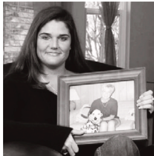
Hospice of Larimer County client engaged in grieving & loss counseling