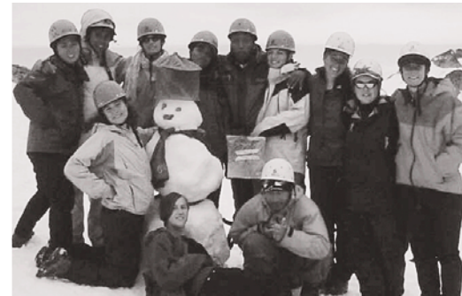
Educo International Alliance Expedition July 2004 British Columbia