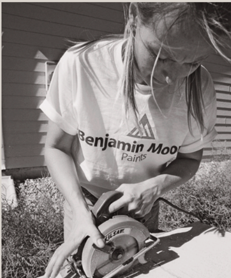
Habitat for Humanity volunteer working on 24th home project in Fort Collins.