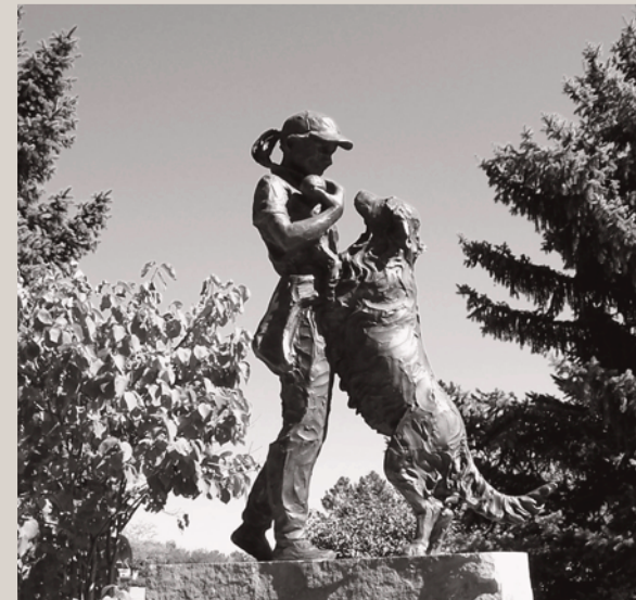
Lindsay Arensmeir Memorial Sculpture "Between Friends"

Disabled Resource Services Endowment Fund The Lois L. Kroh Fund Mary Stranahan Fund