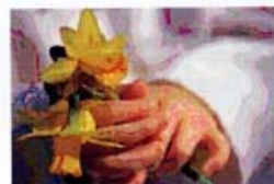
Impacting the community one person at a time.

These are all projects that have exceeded the goals visualized when the proposal was approved.