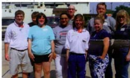
2002 Special Olympics Oklahoma Global Messengers, Speech Coaches, and Volunteers