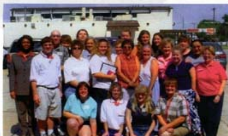
2002 Special Olympics Oklahoma Global Messengers

Three of the Global messengers participated in the Athlete Leadership Program in San Francisco, October 2002. Five were a part of the twenty-member delegation representing the United States at the Special Olympics Summer Games in Dublin, Ireland in June 2003. By means of this program, they are truly, "attaining their fullest potential."