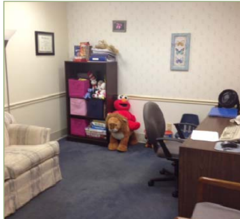
Top: a common therapy space in the Lampion Center before (left) and after renovations. Below: A Guns and Hoses trainer works with Potter's Wheel kids in the SING program.

Potter's Wheel — an innercity ministry providing various programming such as support groups, GED classes, parenting classes, and a clothing bank — launched SING (Stopping Incarceration for the Next Generation) with a $35,000 impact grant from the Women's Fund. SING