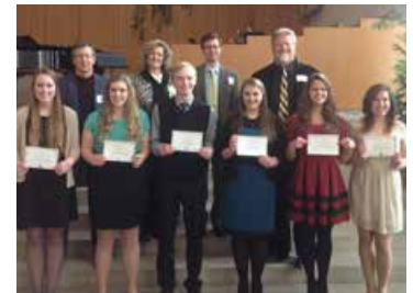
Brown Music Competition

1981 HFBC awards first grant: $500 for City Hall's Art in Public Places Program