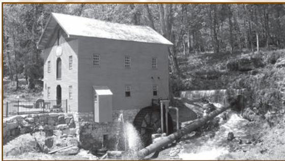
Beck's Mill was awarded a grant for $8,000.00.

The Foundation holds two large community Touch Tomorrow funds and 28 individually named Touch Tomorrow funds. Donors who establish a Touch Tomorrow fund have decided that their best gift to our community is to allow future generations of board members to determine the most pressing needs in our community and then use Touch Tomorrow funds to address these needs.