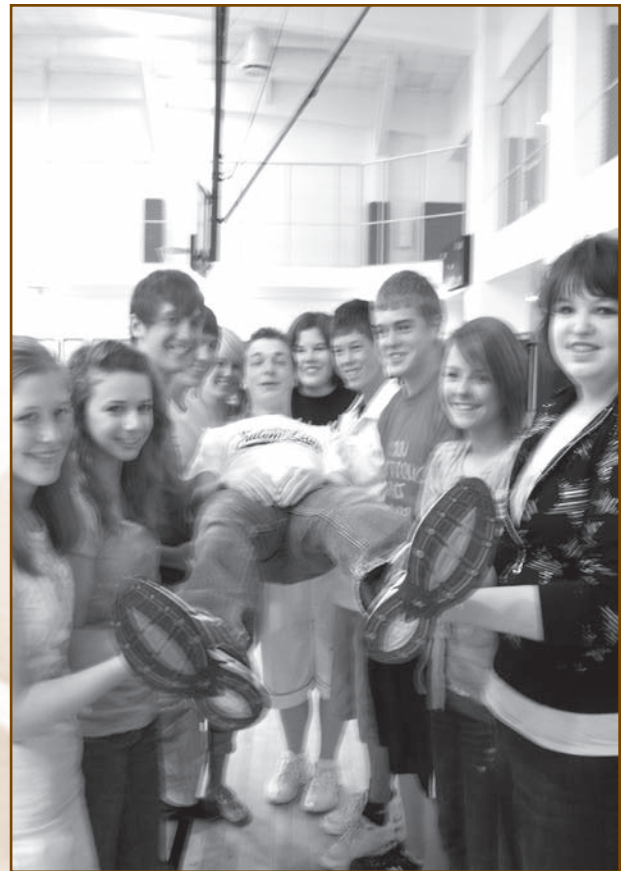
A group of students take part in a trust exercise during the Leadership Olympics where a student is lifted into the air by classmates.