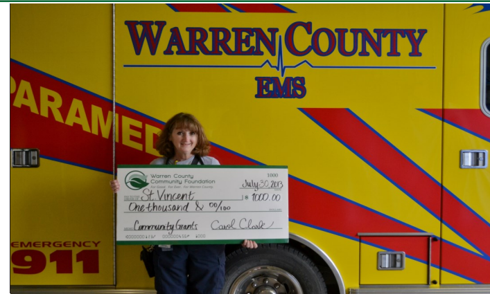
St. Vincent Hospital/EMS