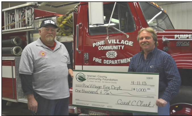
Pine Village Fire Dept.