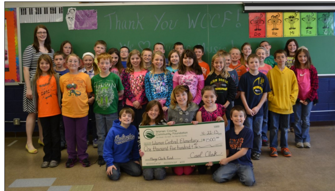
Warren Central Elementary