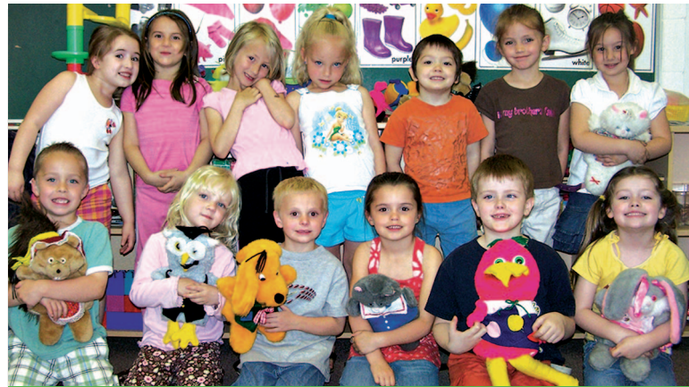
Marshall-Starke Development Center received a grant to install a security system for their "Head Start" facility in Knox.