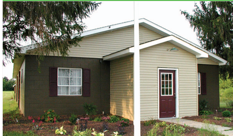
The San Pierre Lions Club received funding for new ceiling tiles for the Community Education Center.