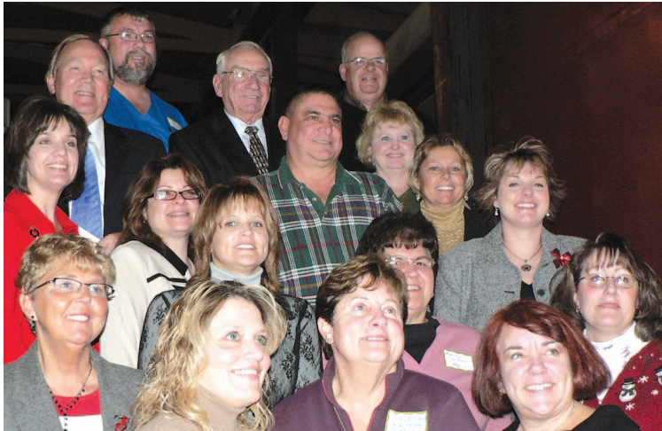
2007 Grant Recipients