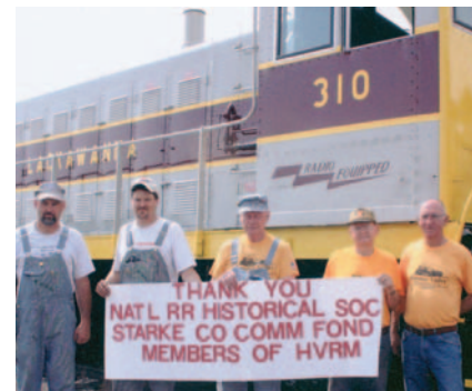
Members of the Hoosier Valley Railroad Museum showed their appreciation for the on-going support the Starke County Community Foundation gives them. The museum benefits annually from their fund.

To all those who have supported the efforts of the Northern Indiana Community Foundation, Inc. and its fund affiliates, we say a big thank you for helping us to grow better communities.