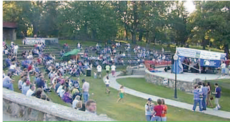
Many people enjoy the celebration and events at North Judson's Mint Festival in Starke County. In 2006, the Starke County Community Foundation awarded the festival's committee $3,000 to upgrade the electrical system of the park to accommodate the needs of the festivities. The foundation has also granted money for repairing the wall and fireplace at North Judson Park, which can also be seen in this picture.