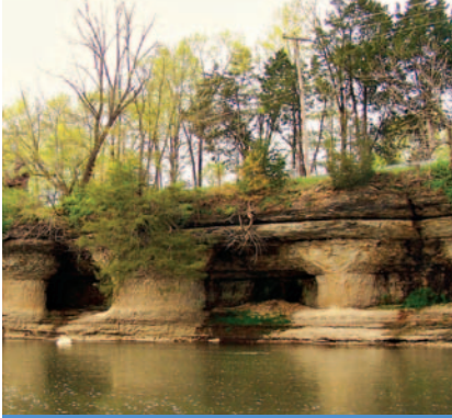
East of Peru, on the north side of the Mississinewa River, stands Seven Pillars—sacred site of the Miami Native Americans.