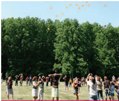
CAMP-WE-CAN for kids with special needs released balloons in celebration of another successful summer camp.

OUR MISSION IS TO IMPROVE THE QUALITY OF LIFE IN OUR COMMUNITIES BY ASSISTING DONORS IN FULFILLING THEIR CHARITABLE WISHES.