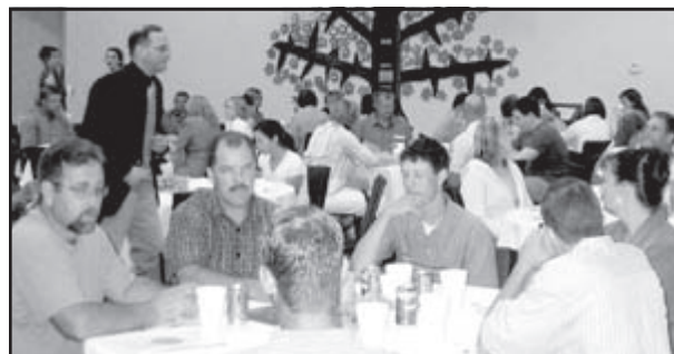
Reception guests enjoyed a delicious meal catered by Peru's famous restaurant, The Siding .