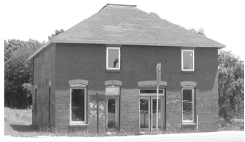
The Toll House in Peru was given a grant from the Miami County Community Foundation to restore this historic building for use as an Educational/Tourism Center for Miami County. The restoration is being organized by Ole Olsen Memorial Theatre, Inc. The group has been instrumental in the restoration and use of many historic buildings in the area.

We thank all of our donors for their continued support in helping meet the needs of our communities. If you would like more information on how we can help you with your philanthropic goals, please contact our office, or any of our board members.