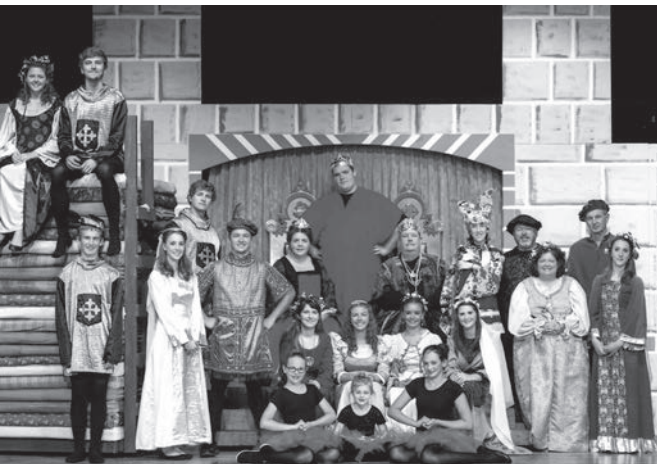
The Carnegie Players, Inc. production of Once Upon A Mattress