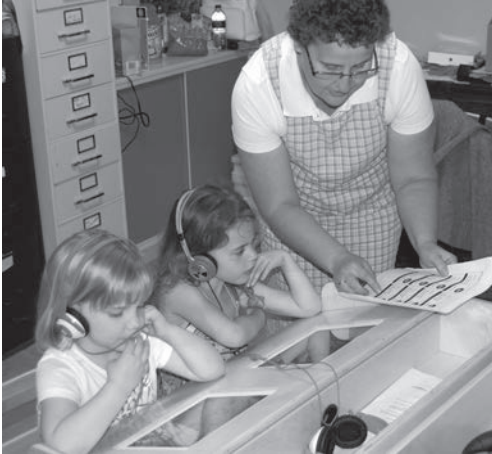
Brook United Methodist Church ABC Preschool educational technology centers