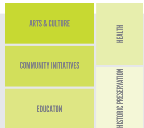
STRATEGIC FOCUS AREAS