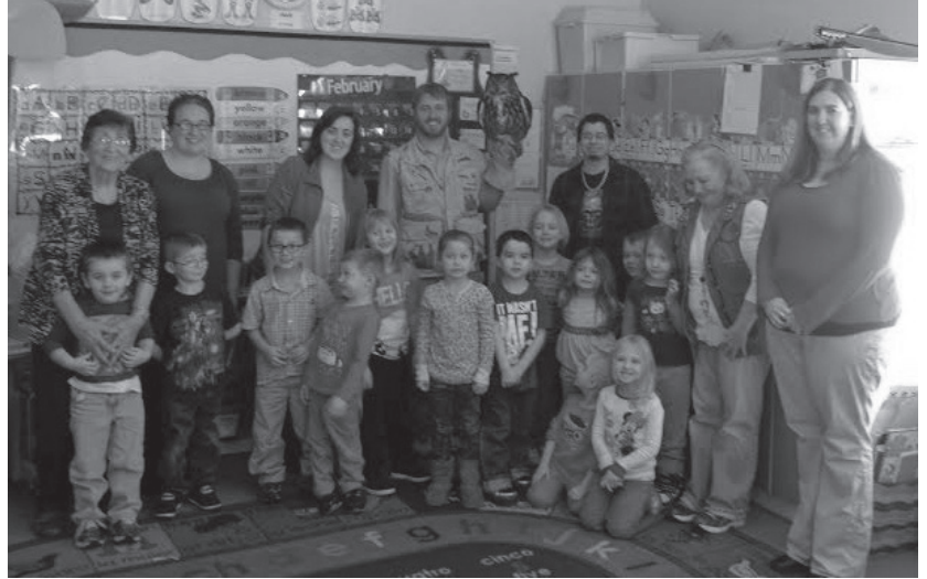
Kankakee Iroquois Regional Planning Commission Silly Safari (Jasper and Newton County)