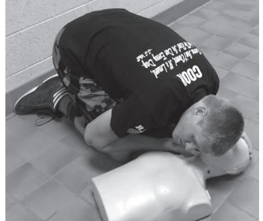
Tri-County Physical Education