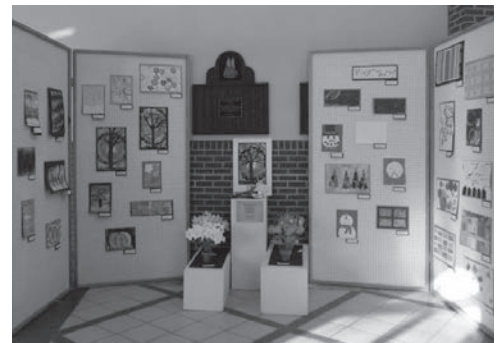
Prairie Arts Council Art Show at Saint Joseph's College