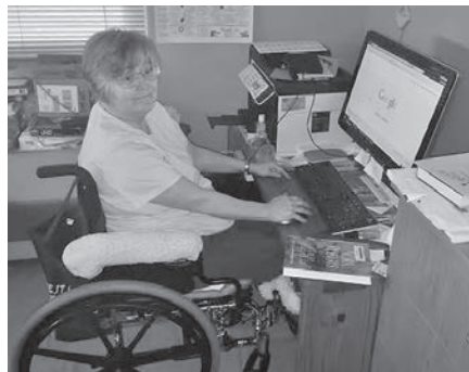
George Ade Memorial Health Care Center Network improvements