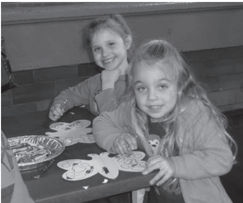
Newton County Step Ahead literacy improvement initiatives