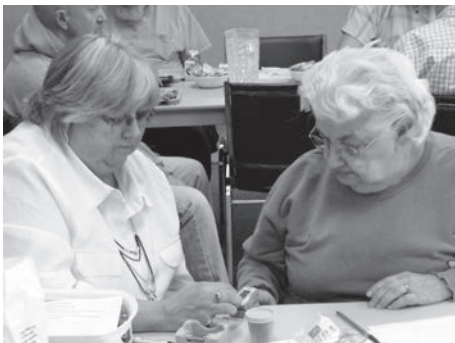
Franciscan Home Care Services, Inc. Post Hospital Care Transitions Program