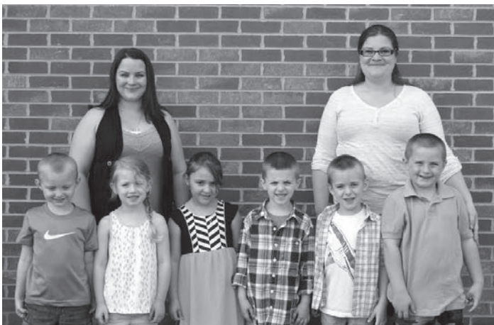
Kentland Trinity United Methodist Church Preschool rotational learning centers