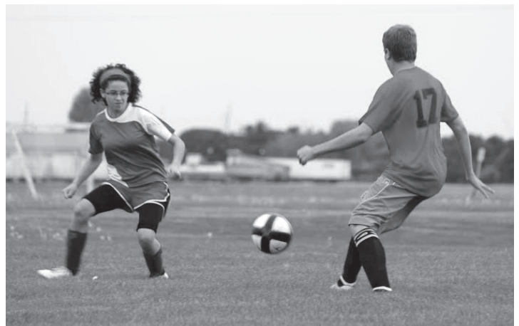
DeMotte River Valley Soccer Association