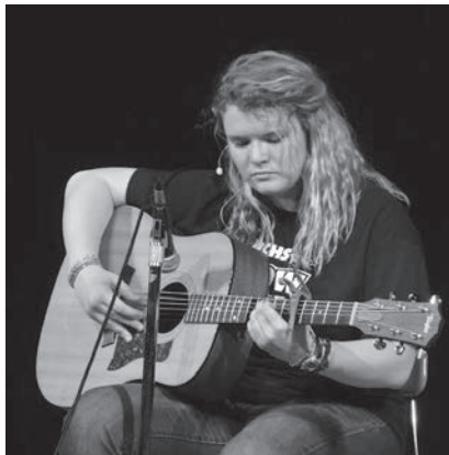
RCCHS Choral Department upgraded sound system