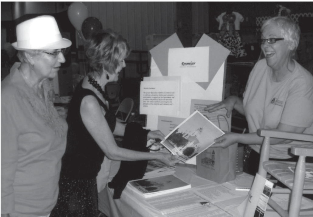
2012 Jasper County Volunteer Fair.