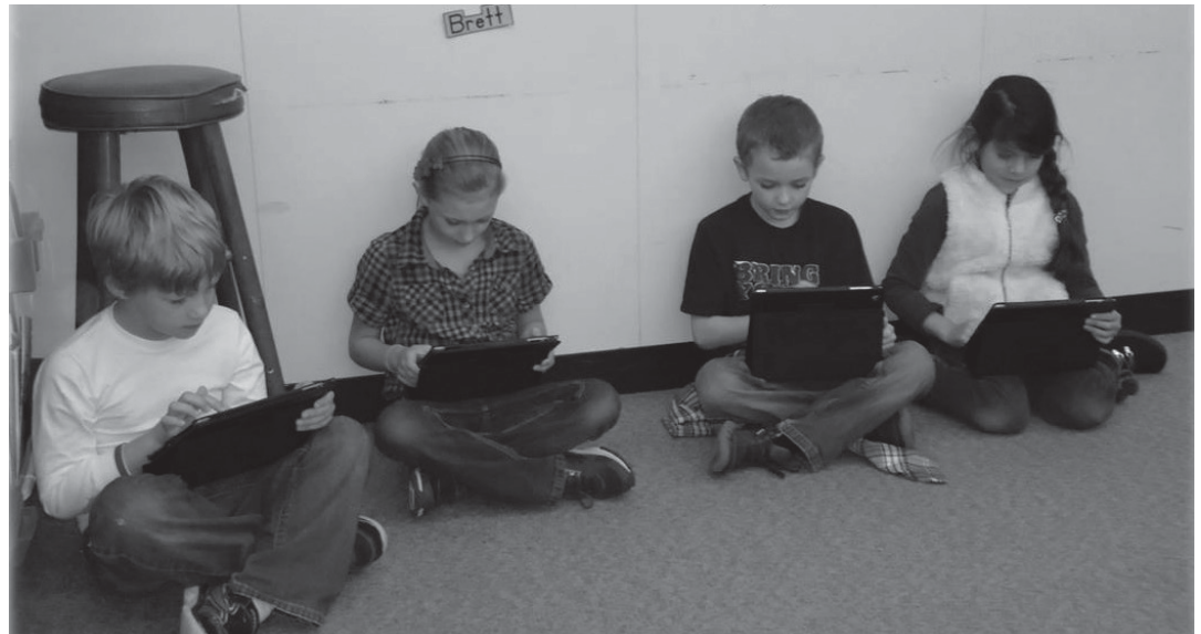
Children benefiting from a Tri-County schools grant.