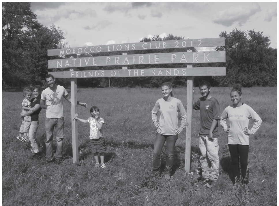
Morocco Lion's Club Friends of the Sands.