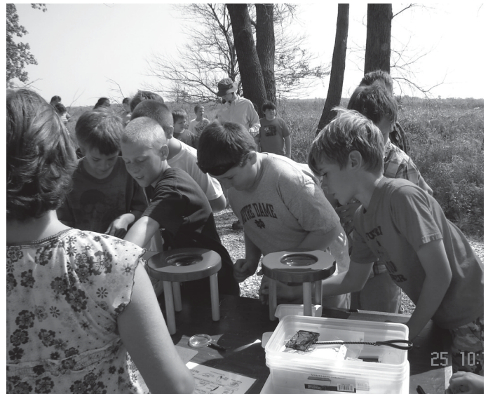
Newton County Science Day.