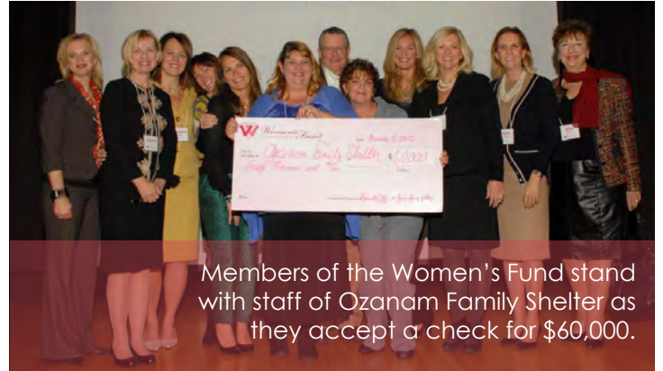
Members of the Women's Fund stand with staff of Ozanam Family Shelter as they accept a check for $60,000.

Ozanam Family Shelter, among a host of other services, provides emergency shelter to homeless families and single women. They currently have the capacity to serve 17 families and six single women.